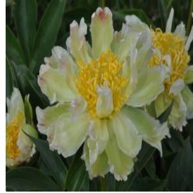
Paeonia lactiflora Green Lotus Height: 24-28 in Spread: 24-36 in Zone: 3-8