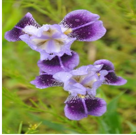
Iris germanica Dividing Line Height: 22-24 in Spread: 12-24 in Zone: 3-9