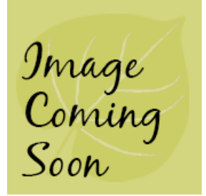
Spiraea decumbens Height: 6-18 in Spread: 18-24 in Zone: 4-10