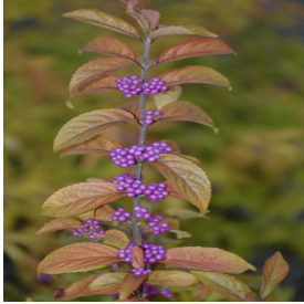
Callicarpa dichotoma Early Amethyst Height: 3-4 ft Spread: 3-4 ft Zone: 5-8