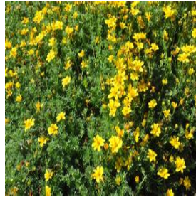
Bidens ferulifolia Goldilocks Rocks® Height: 12-14 in Spread: 14-18 in Zone: 9-11