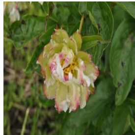
Paeonia lactiflora Alley Cat Height: 30-36 in Spread: 24-36 in Zone: 3-8