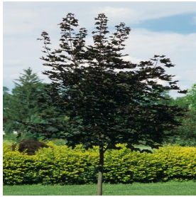
Acer platanoides Crimson King Height: 40-50 ft Spread: 25-30 ft Zone: 3-7