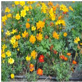
Cosmos sulphureus Cosmic Orange Height: 12-18 in Spread: 12-18 in Zone: 10-11