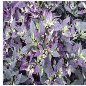
Capsicum annuum Purple Flash Height: 12-24 in Spread: 15-20 in Zone: 9-11