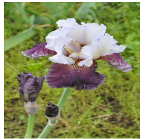
Iris germanica Coming Storm Height: 36-38 in Spread: 12-24 in Zone: 3-9