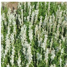
Salvia farinacea Evolution White Height: 16-20 in Spread: 14-16 in Zone: 8-10