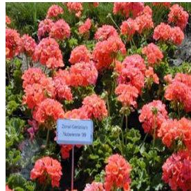
Pelargonium x hortorum Classic Dark Salmon Height: 10-12 in Spread: 12-14 in Zone: 10-11