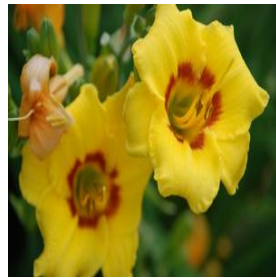
Hemerocallis x Siloam June Bug Height: 18-24 in Spread: 18-24 in Zone: 3-9