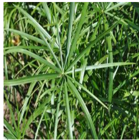
Cyperus involucratus Baby Tut® Height: 20-32 in Spread: 20-36 in Zone: 9-11