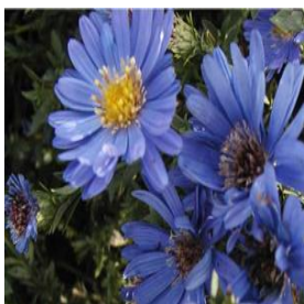
Symphyotrichum (Aster) dumosus Sapphire Height: 12-24 in Spread: 12-24 in Zone: 4-8