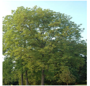
Carya illinoensis Height: 75-100 ft Spread: 40-70 ft Zone: 5-9