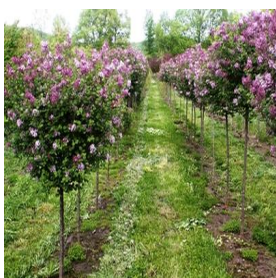
Syringa meyeri Palibin Height: 4-5 ft Spread: 5-7 ft Zone: 3-7