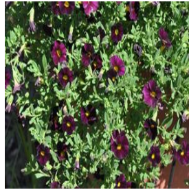
Calibrachoa Can-Can® Purple Star Height: 10-15 in Spread: 8-12 in Zone: 9-11