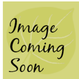
Papaver orientalis Brilliant Height: 20-30 in Spread: 18-24 in Zone: 3-7