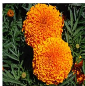
Tagetes erecta Moonsong Deep Orange Height: 10-24 in Spread: 14-18 in Zone: 10-11