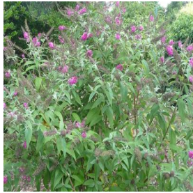
Buddleia x Miss Ruby Height: 4-5 ft Spread: 4-5 ft Zone: 5-10