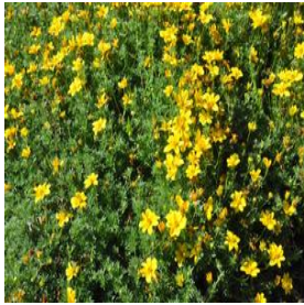
Bidens ferulifolia Goldilocks Rocks® Height: 12-14 in Spread: 14-18 in Zone: 9-11