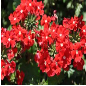
Verbena x hybrida Tukana® Scarlet Height: 4-8 in Spread: 20-24 in Zone: 8-11