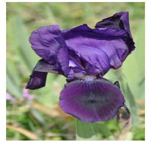
Iris germanica Eleanor Roosevelt Height: 21-24 in Spread: 12-24 in Zone: 3-9