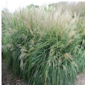
Miscanthus sinensis Adagio Height: 4-5 ft Spread: 3-4 ft Zone: 5-9