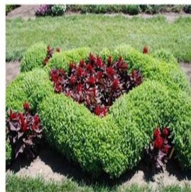
Ocimum basilicum Boxwood Height: 10-14 in Spread: 10-18 in Zone: 9-11