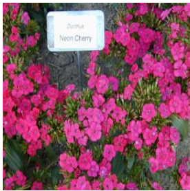
Dianthus Amazon Neon Cherry Height: 18-24 in Spread: 10-12 in Zone: 7-9