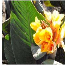
Canna Chocolate Sunrise Height: 36-42 in Spread: 36-42 in Zone: 7-10