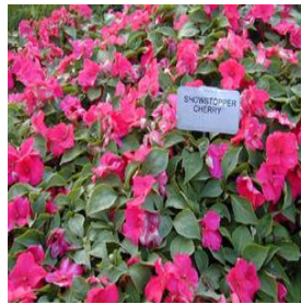
Impatiens walleriana Showstopper Cherry Height: 10-15 in Spread: 12-18 in Zone: 10-11