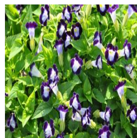
Torenia fournieri Kauai Deep Blue Height: 8-16 in Spread: 8-16 in Zone: 10-11