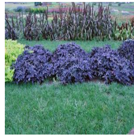
Ipomoea batatas Sidekick™ Series Height: 12-14 in Spread: 2-4 ft Zone: 9-11