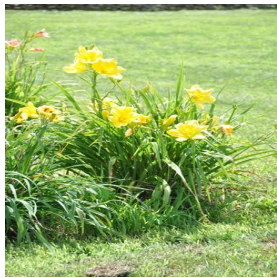
Hemerocallis x Siloam Space Age Height: 24-28 in Spread: 24-36 in Zone: 3-9