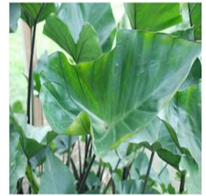
Colocasia esculenta Coffee Cups Height: 4-6 ft Spread: 4-6 ft Zone: 8-11