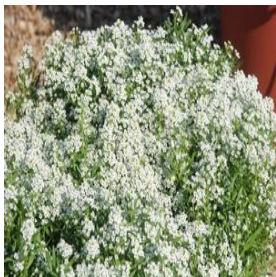
Lobularia maritima Silver Stream™ Height: 8-12 in Spread: 12-14 in Zone: 9-11