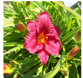
Hemerocallis x Little Business Height: 12-18 in Spread: 12-18 in Zone: 4-11