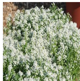
Lobularia maritima Silver Stream™ Height: 8-12 in Spread: 12-14 in Zone: 9-11