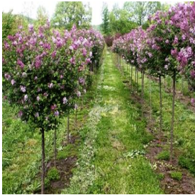
Syringa meyeri Palibin Height: 4-5 ft Spread: 5-7 ft Zone: 3-7