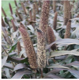
Pennisetum glaucum Purple Majesty Height: 4-5 ft Spread: 1-2 ft Zone: 10-11