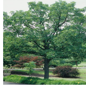
Quercus macrocarpa Height: 70-80 Feet Spread: 70-80 Feet Zone: 3-8