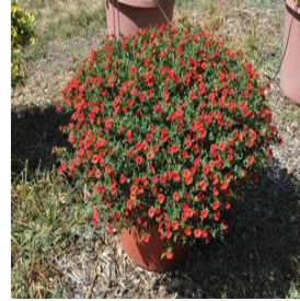
Calibrachoa Superbells® Scarlet Height: 6-12 in Spread: 12-24 in Zone: 9-11