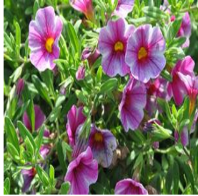
Calibrachoa Can-Can® Hot Pink Star Height: 10-15 in Spread: 8-12 in Zone: 9-11