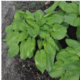
Hosta Squash Casserole Height: 12-20 in Spread: 36-40 in Zone: 2-8