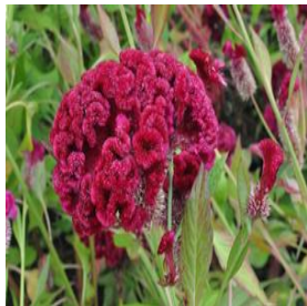
Celosia argentea var. cristata Cramer's Burgundy Height: 30-36 in Spread: 15-24 in Zone: 10-11