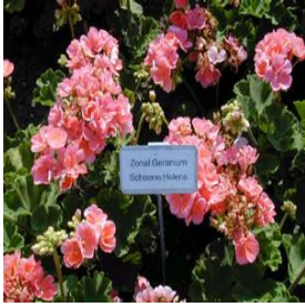
Pelargonium x hortorum Classic Salmon Height: 10-12 in Spread: 12-16 in Zone: 10-11