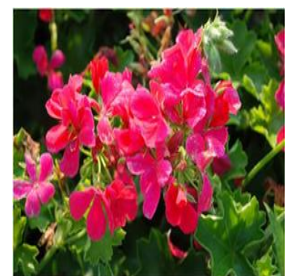
Pelargonium x Caliente Rose Height: 12-18 in Spread: 12-16 in Zone: 9-11