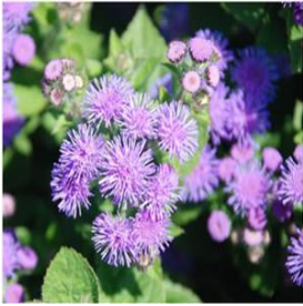
Ageratum Artist™ Series Height: 8-12 in Spread: 10-14 in Zone: 9-10