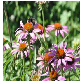
Echinacea purpurea Ruby Star Height: 30-36 in Spread: 18-24 in Zone: 3-8