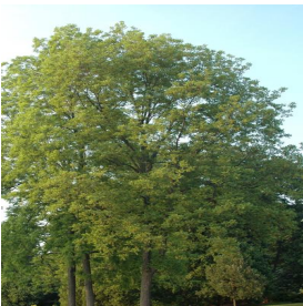
Carya illinoensis Height: 75-100 ft Spread: 40-70 ft Zone: 5-9