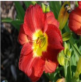
Hemerocallis x Scarlet Orbit Height: 20-24 in Spread: 12-24 in Zone: 3-10