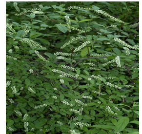
Itea virginica Height: 3-6 ft Spread: 3-6 ft Zone: 5-9