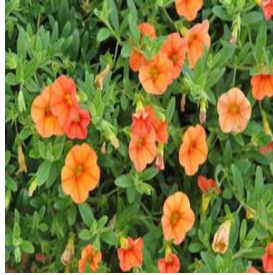
Calibrachoa Superbells® Dreamsicle Height: 6-12 in Spread: 12-24 in Zone: 9-11